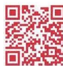
Scan here to learn more